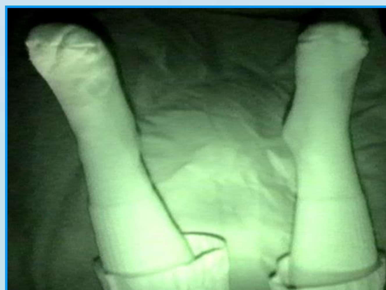
Figure 1: Images of live, contingent and pre-recorded, noncontingent videos of children's leg motions.

Nine ASD ( M = 3.60 yrs) and nine TD children ( M = 2.55 yrs), matched for functional age on the ABAS (ASD: M = 2.23 yrs, SD = .84 ; TD: M = 2.30 yrs, SD = .54 ), participated in a task identical to Bahrack & Watson's (1985) visual paired-comparison procedure. A perfectly contingent, live video of the child's own leg motions was shown alongside a pre-recorded noncontingent video of a peer's leg motions, both wearing white socks (see Figure 1). Participants received eight 15-s trials, with the right/left positioning of the contingent and noncontingent displays switched after four trials and counterbalanced across children.