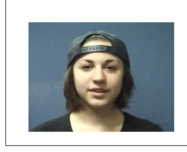
"Look at the mommy."