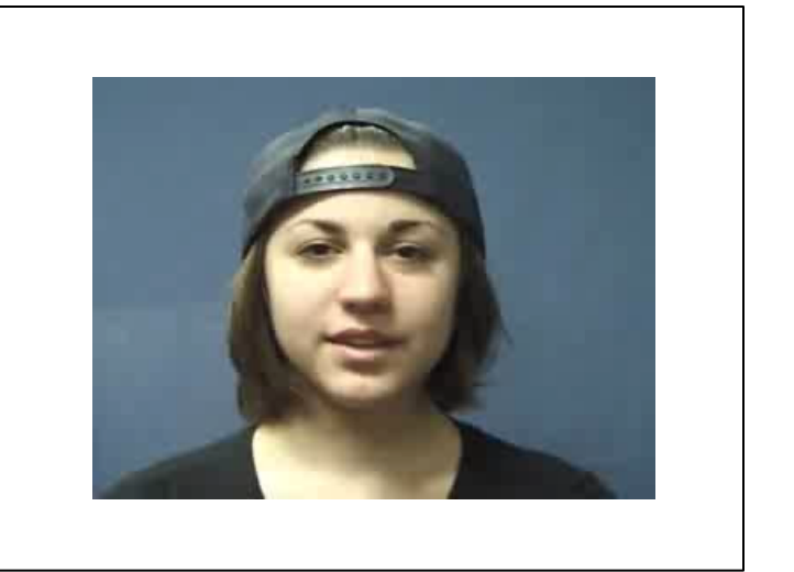
"Which mommy spoke faster?"