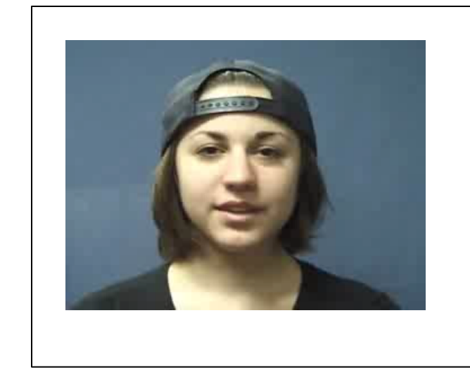
Figure 1b. Children viewed two static images of the woman, one on each side of the screen. They were asked to point to which mommy spoke faster.