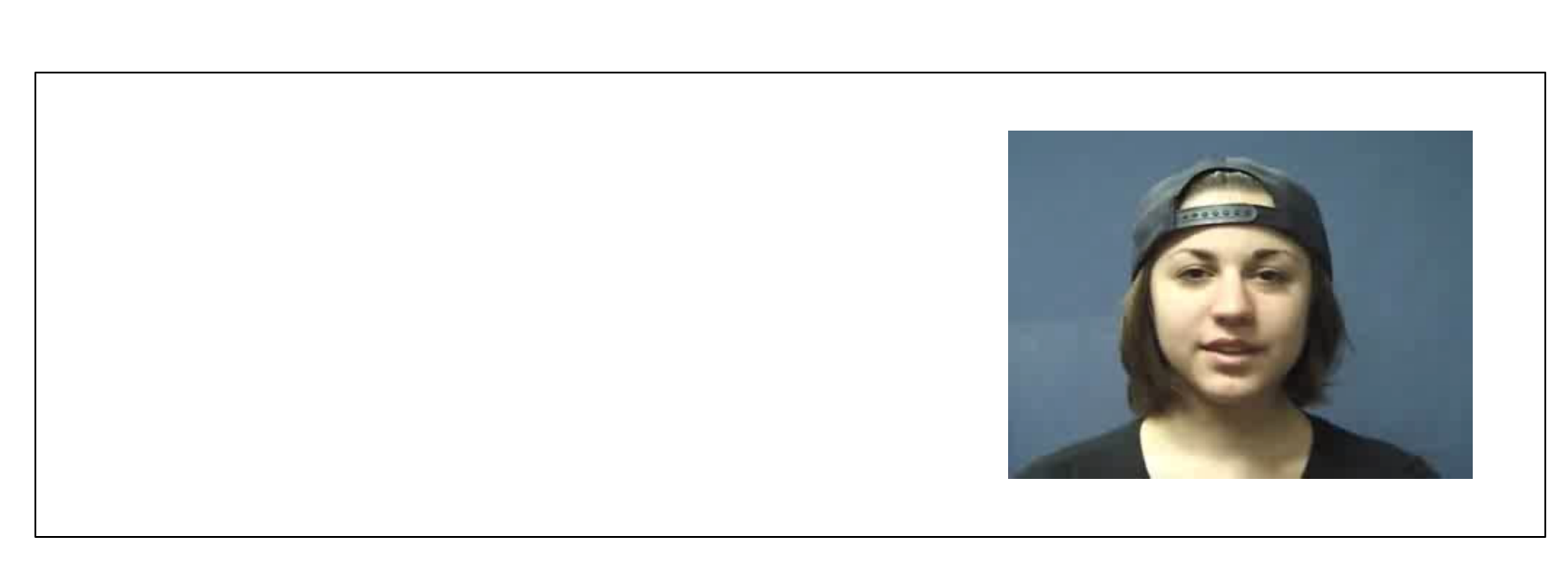
"Look at the mommy."